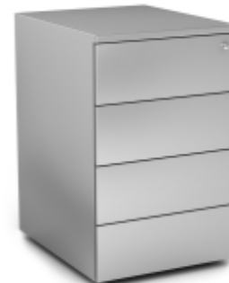
MMP-640-S (mobile) MFP-640-S (fixed)