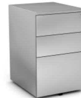
MMP-640-BS (mobile) MFP-640-BS (fixed)