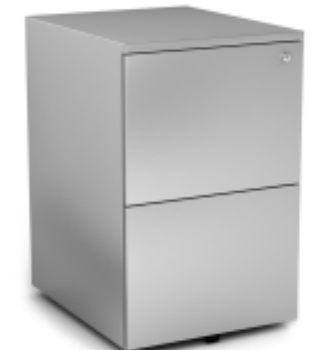
MMP-640-B (mobile) MFP-640-B (fixed)